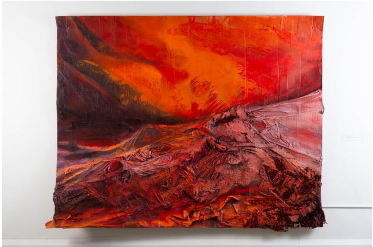
Artemis Herber, born in Germany, lives in the USA