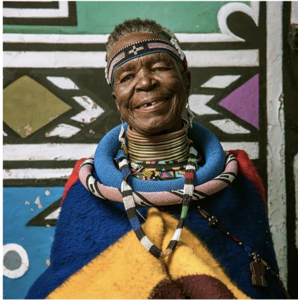
Esther Mahlangu, born and lives in South Africa