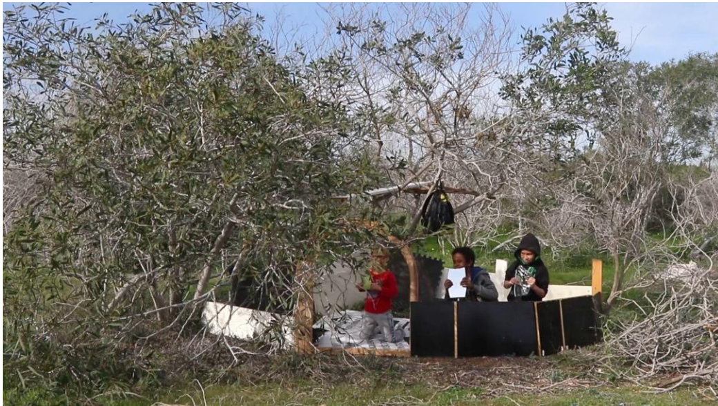
Efi Savvidis, born and lives in Cyprus