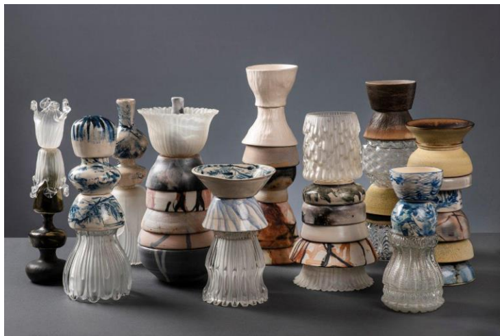
Melina Shukuroglou, born and lives in Cyprus