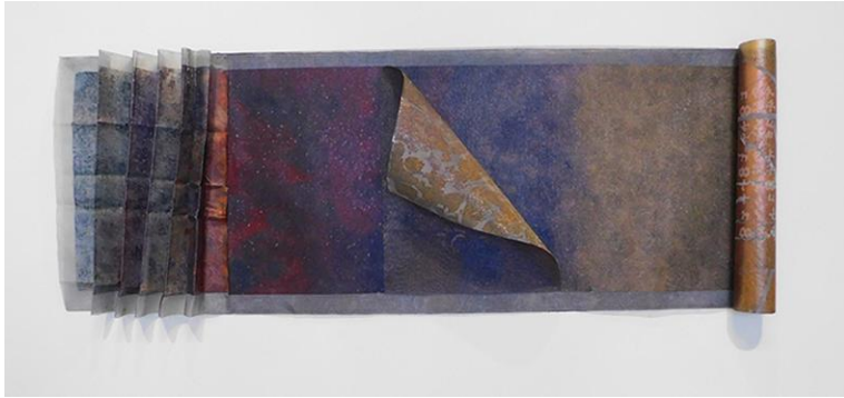
Kebedech Tekleab, born in Ethiopia, lives in the USA