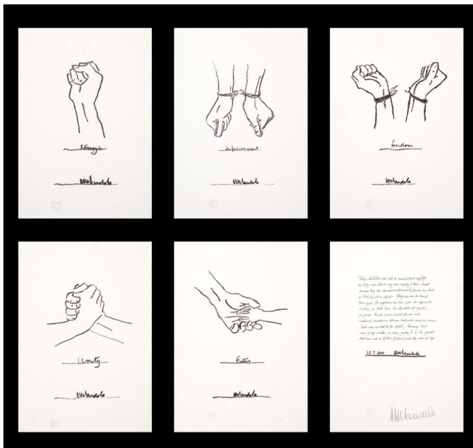
Nelson Mandela, born in South Africa