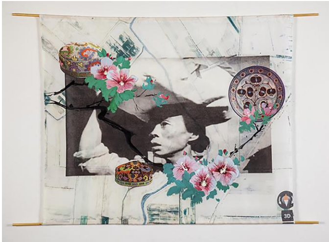
Evgenia Kim, born in Uzbekistan, former USSR from Korean parents, lives in the USA